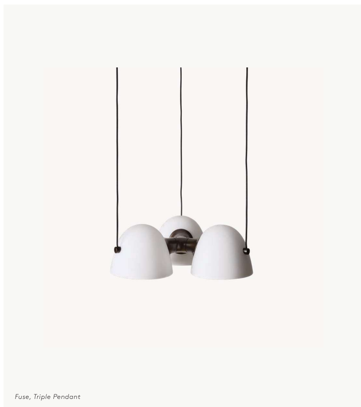
Fuse, Triple Pendant